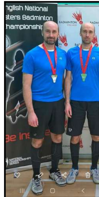
White Brothers Winners