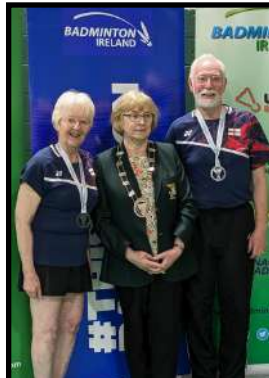
Irish Invitation Silver