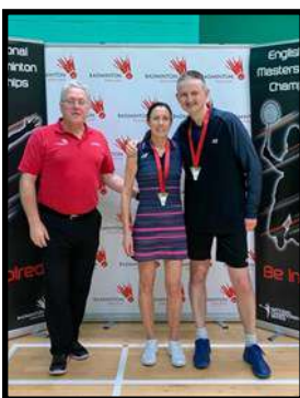
National O50Mixed Winners