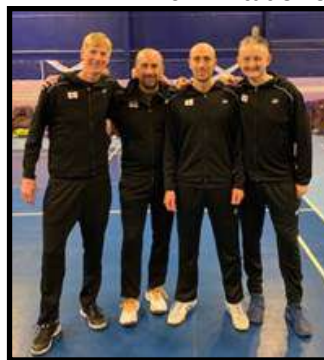
McCoig Trophy England Squad