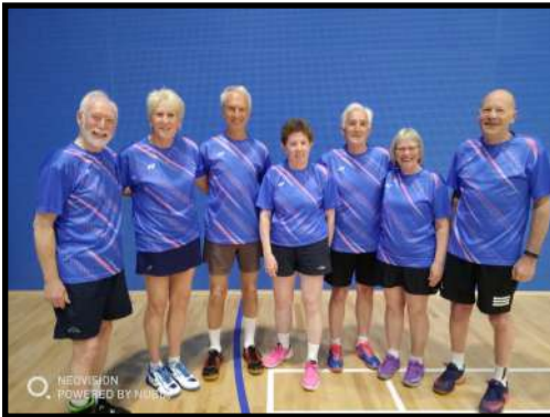
ICC Division 1A Winners