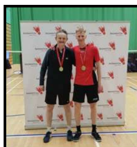
All England Over 50 winners 2023

I hope you all have a great summer and comeback next season ready to go again.